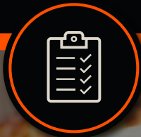
AUDIT & ASSURANCE