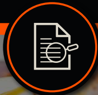
BUSINESS RECOVERY & INSOLVENCY