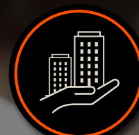
PROPERTY ADVISORY SERVICES